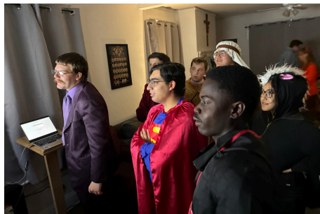
Students working hard to solve the clues during our Halloween Party Escape Room created by our Student Leaders.