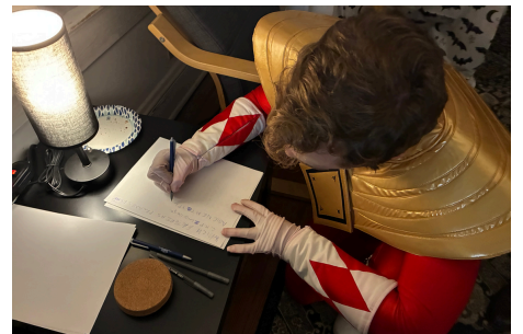
Games in the CCM House.