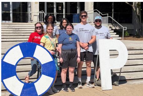
Out of the Darkness Suicide Prevention Walk