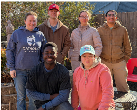
Alternative Spring Break 2026