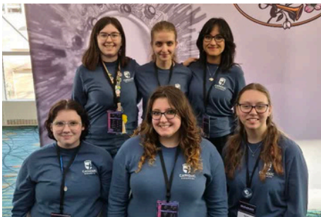
The Ladies of CCM at Summit