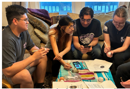
Egg Dyeing with Orthodox Christian Fellowship