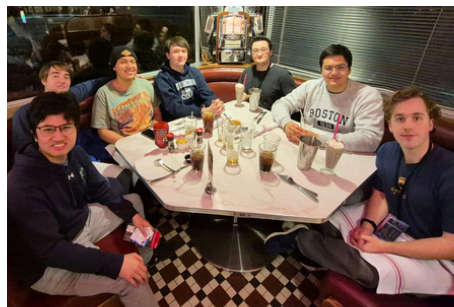
The Gents on a Silver Diner adventure