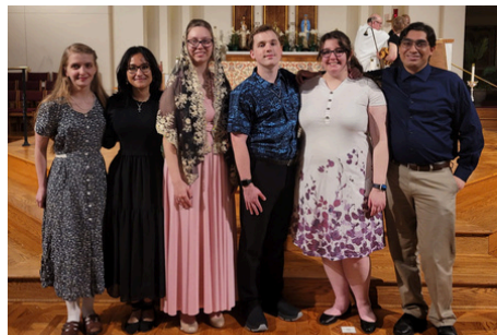
A few CCM students at the Easter Vigil