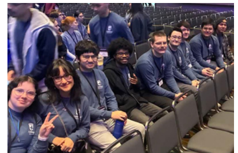
Waiting for the next session to begin