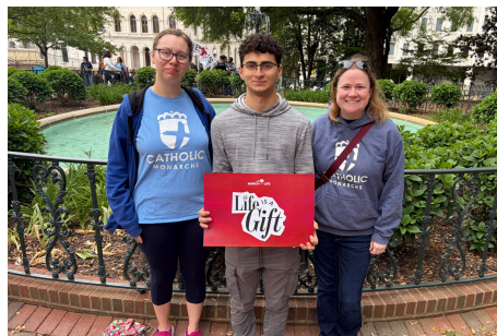
Virginia March for Life