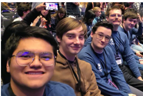
Relaxing before the next keynote session