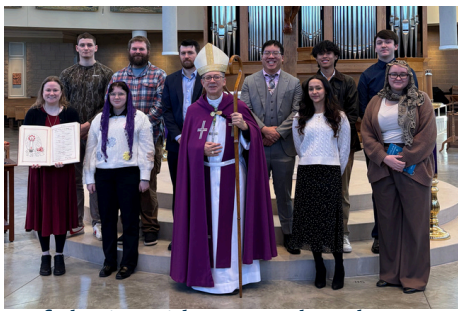
Rite of Election with CCM & Blessed Sacrament