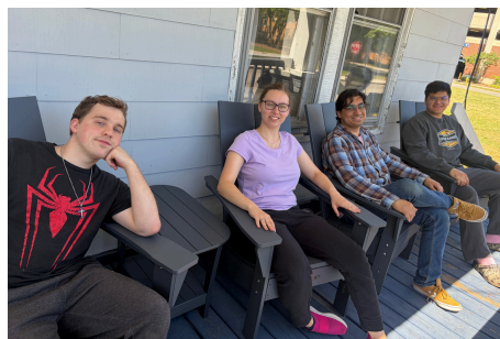
Students enjoying the new porch furniture