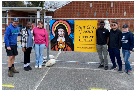
ODU & VCU joined together for an Alternative Spring Break trip!