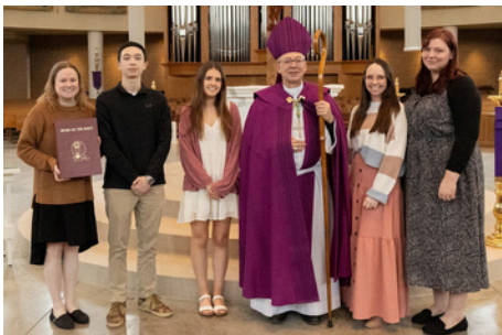
CCM & Blessed Sacrament at the Eastern Vicariate Rite of Election