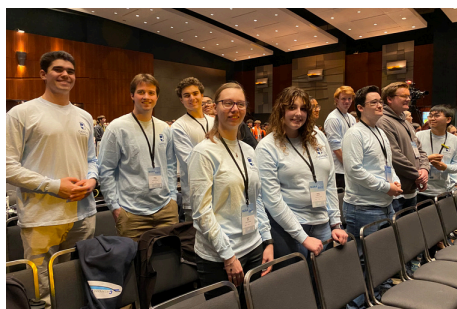
Singing at the beginning of the Evening Session at Summit