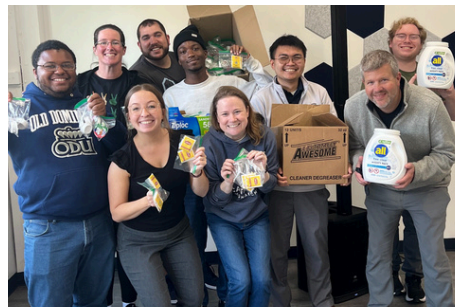
UCA Service Night for the Monarch Pantry