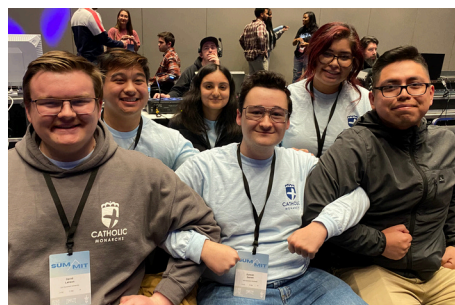
Waiting for the General Session