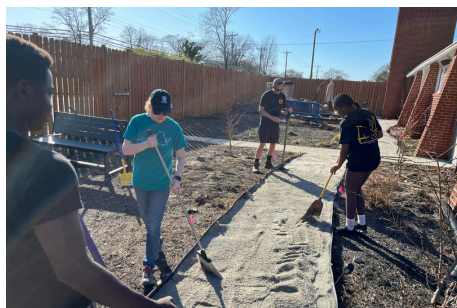
Creating a path in the gardens at ASB