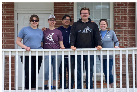
Day of Service at St. Charles Catholic Church in Cape Charles, VA