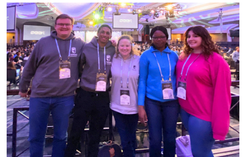
SEEK25 Conference in Washington, DC