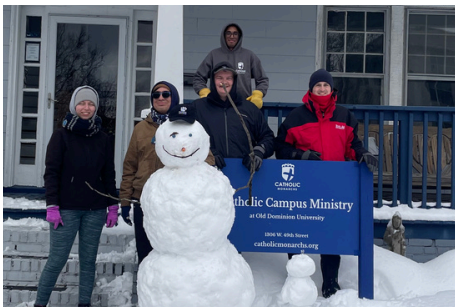
Snow Day at CCM